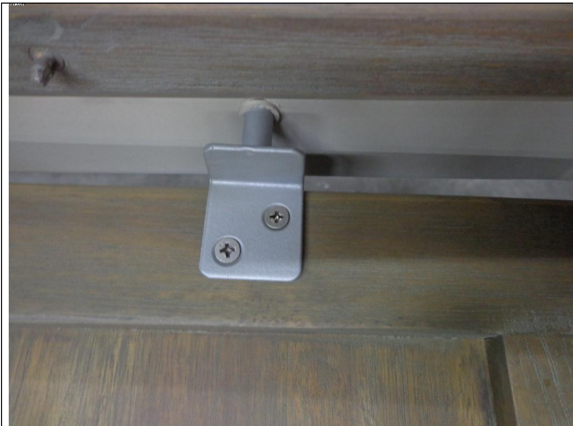
Metal tumbling pin of inlay.