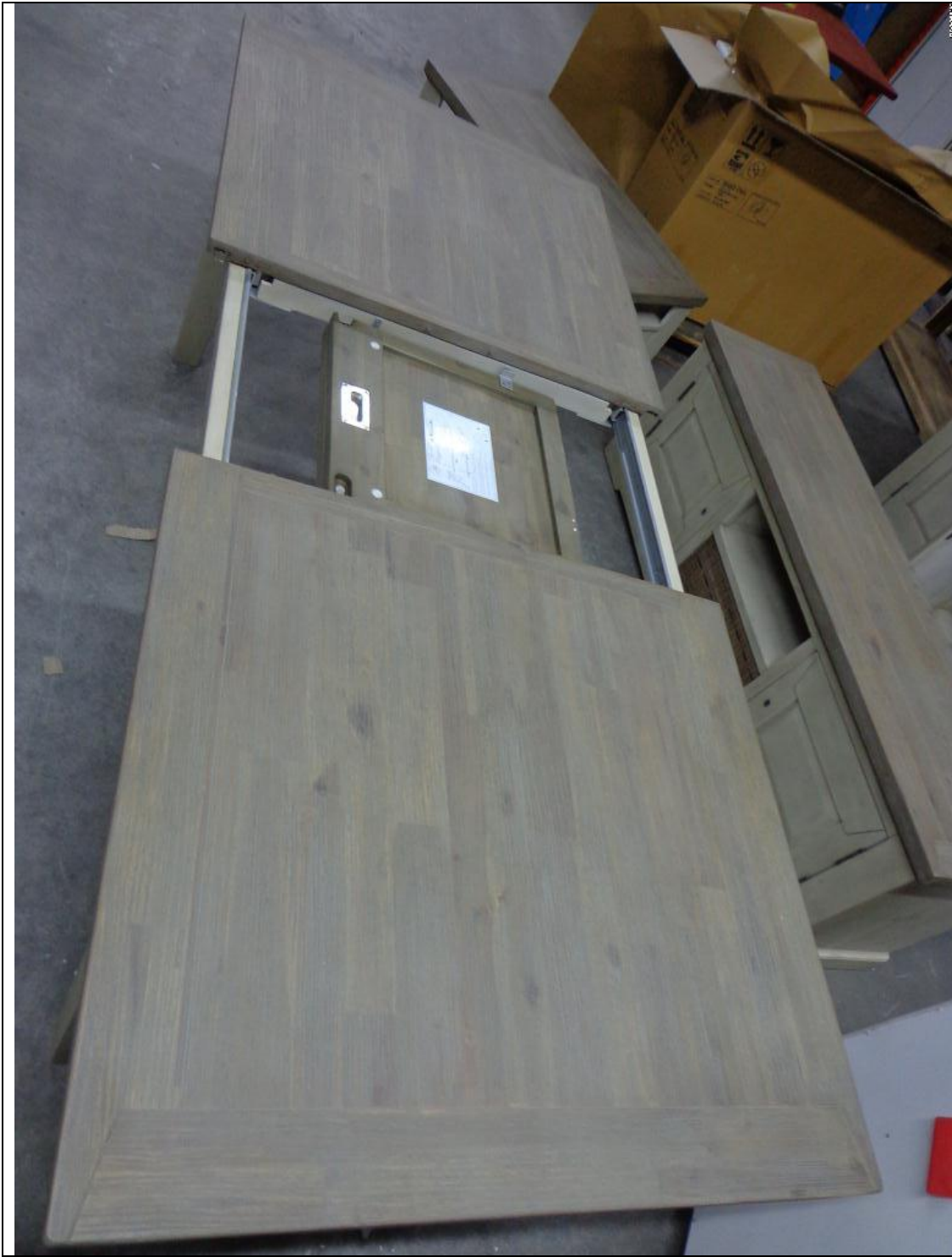
Sliding tables have moving top and butterfly inlay in middle.