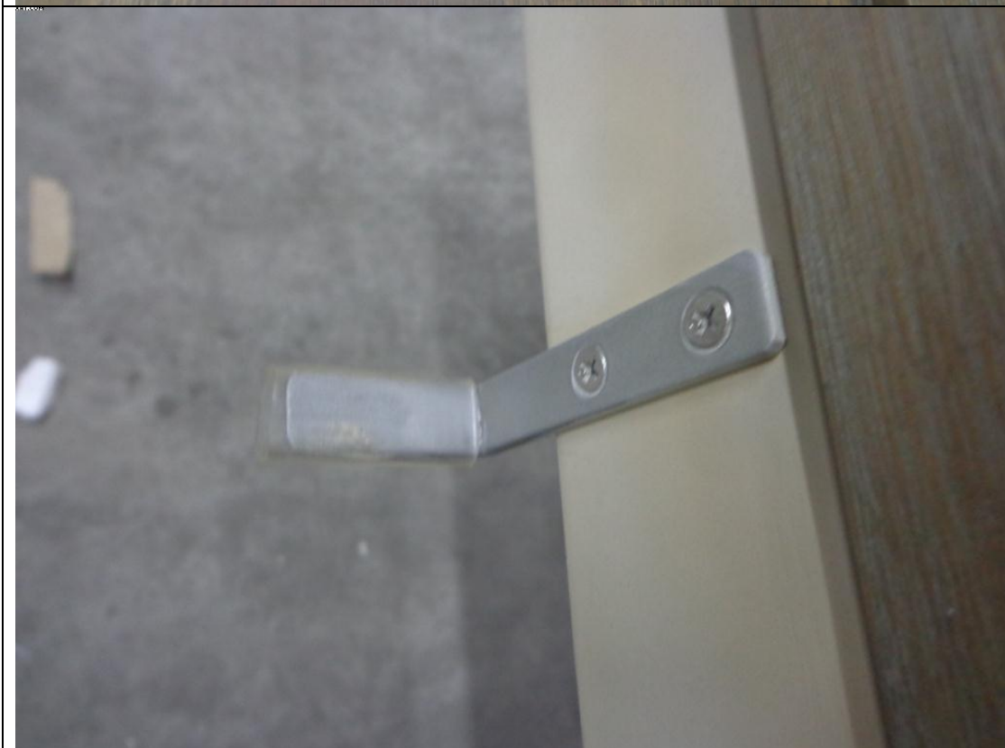
Metal support on which inlay can be stored.