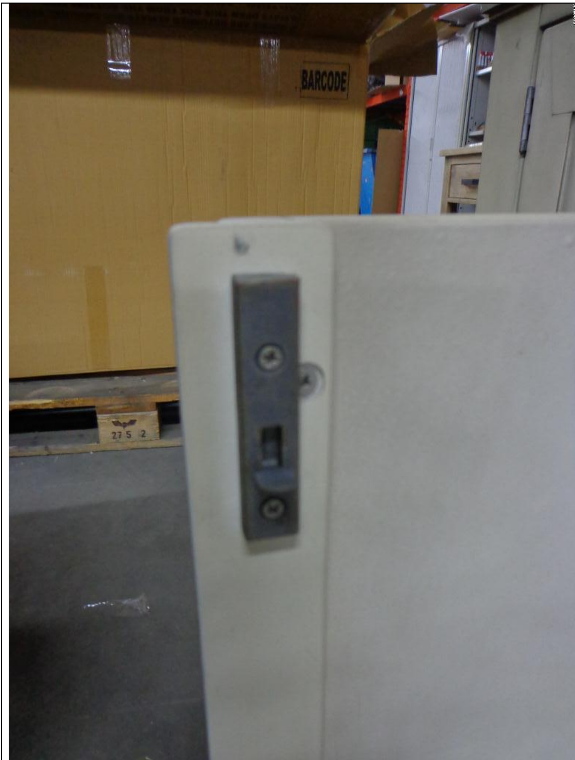
Sliding lock for doors.