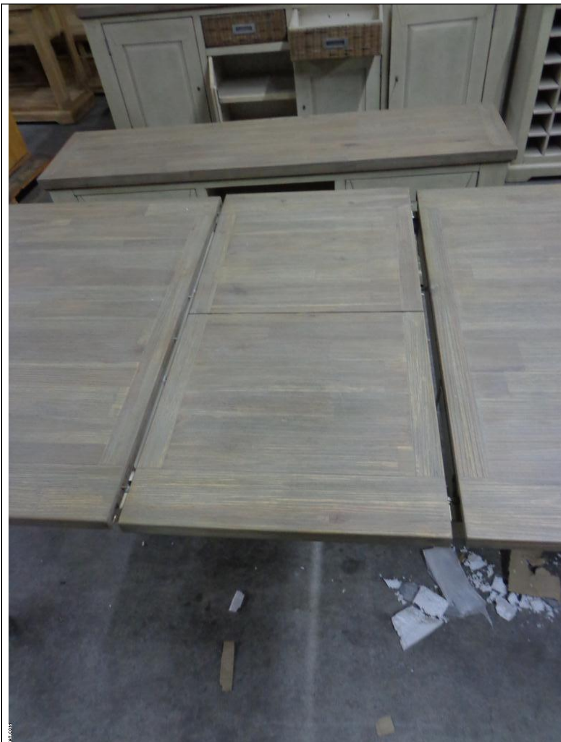
Sliding tables have moving top and butterfly inlay in middle.