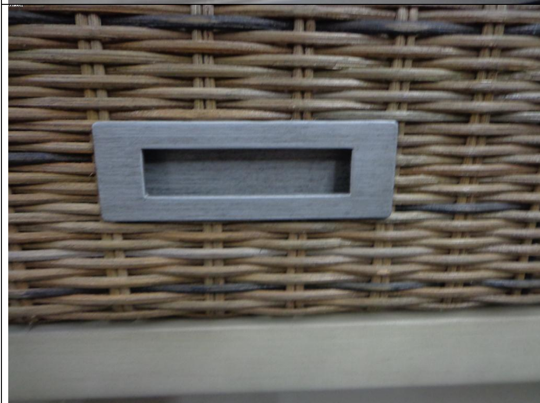
Drawer front in rattan, metal grip.