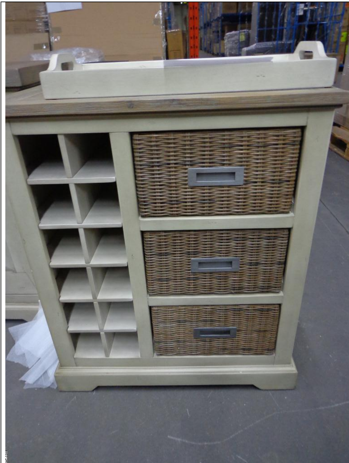
Wine chest; tray on top is included in the item.