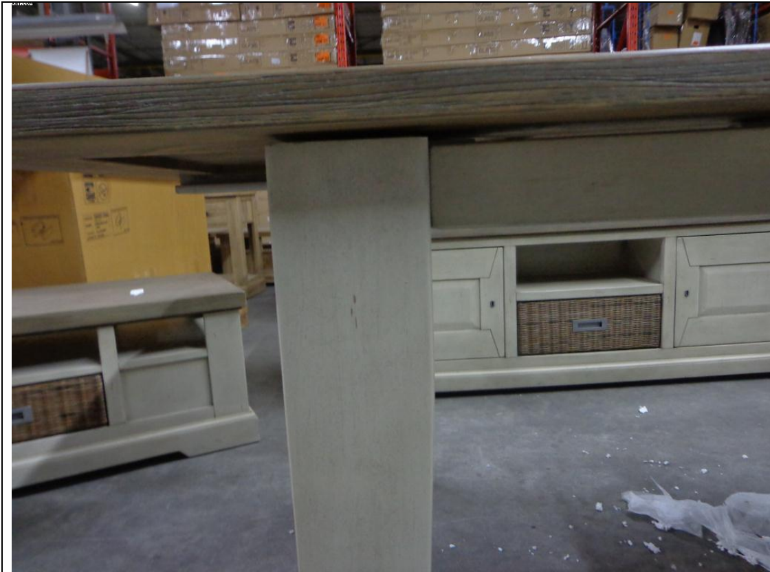
Aging table legs.