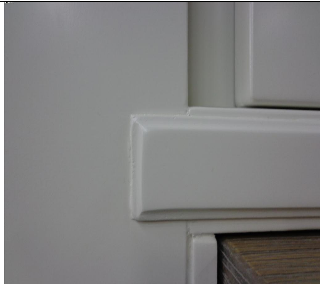
Front frame connection.