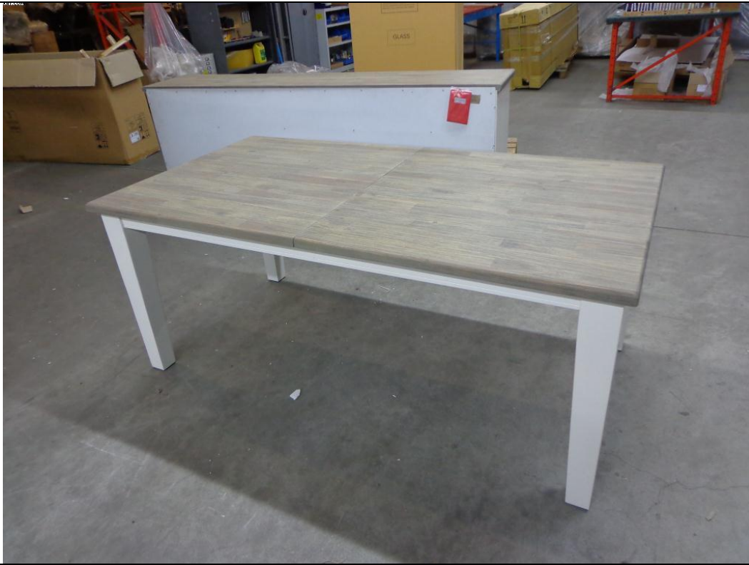
Extendable table in closed position.