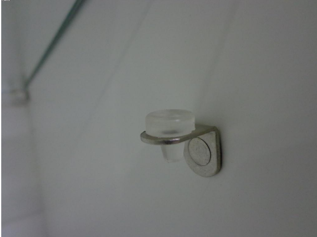
Shelf support with silicon damper.