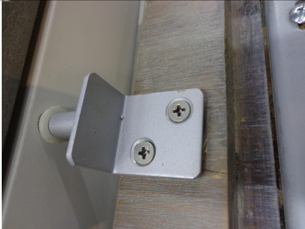
Hook for fixing inlay to metal extension frame.