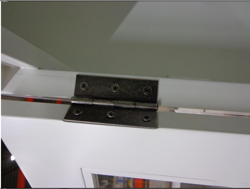
Leaf hinge, not adjustable.