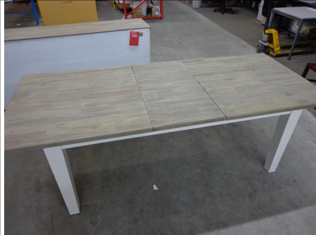
Table in extended position.

After unfolding table side need to be closed to fix the inlay.