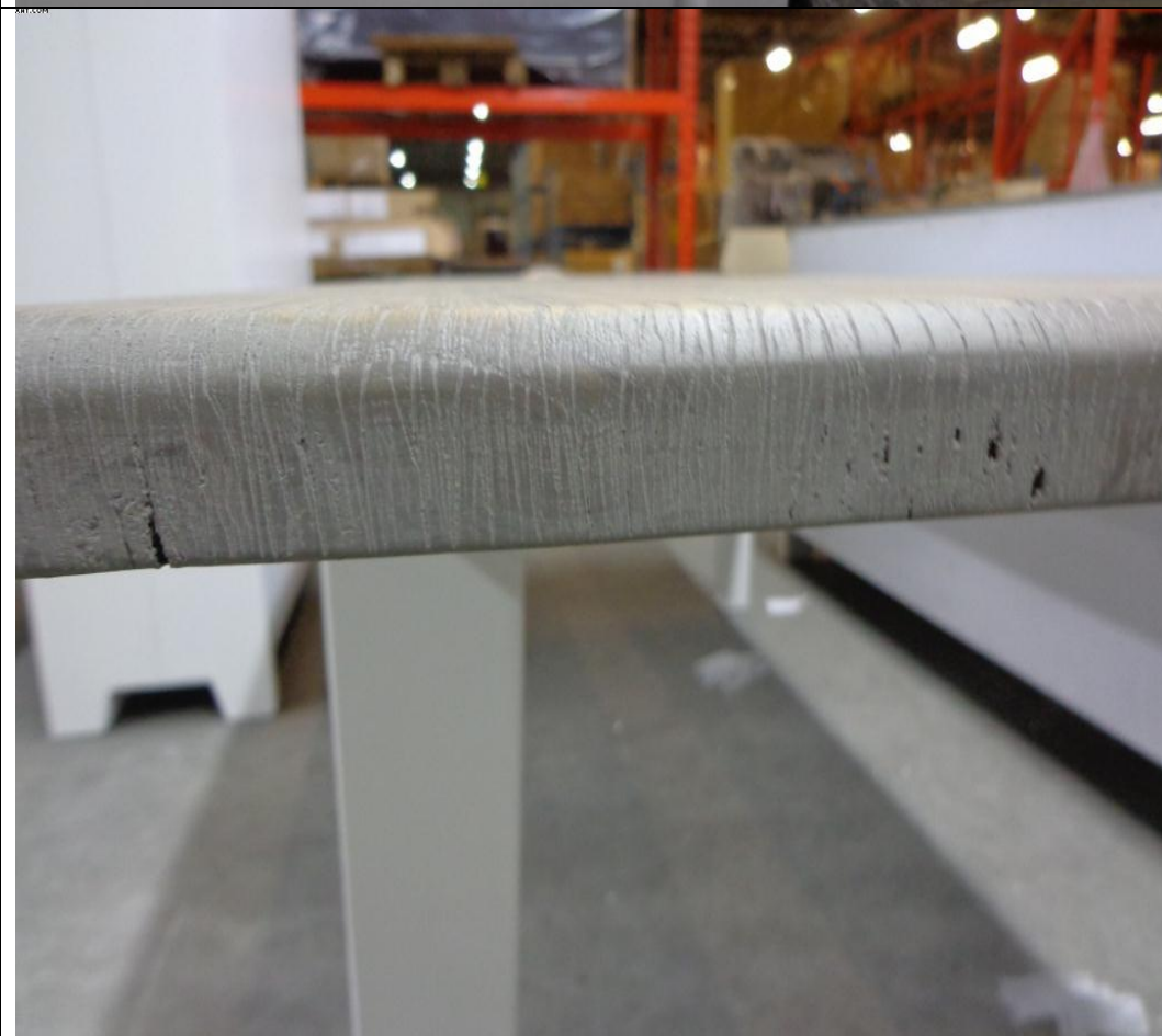
These open "knots" are due to manual aging of the wood. This is no cause for complaint.