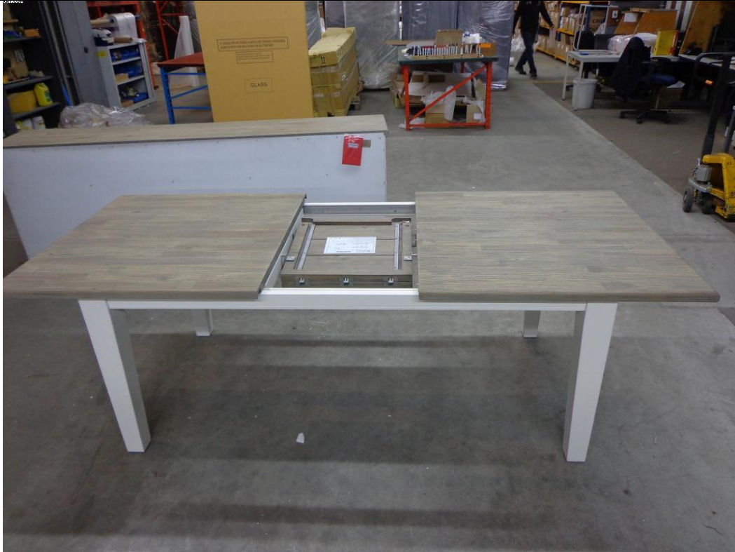
Make sure, when table needs to be extended both sides are being opened completely before unfolding the butterfly extension plate. This to prevent damage to top as well as inlay.