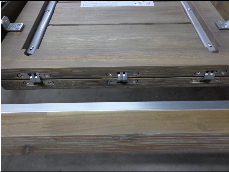
SOSS hinges for folding the inlay.