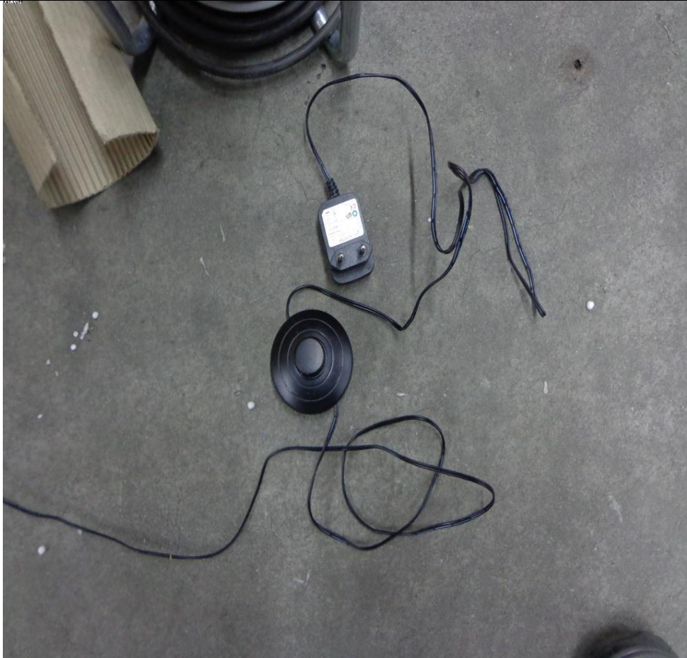
Foot switch for turning light on and of, not a dimmer.