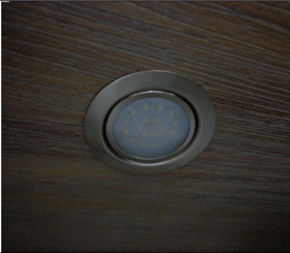
Inserted led spot.