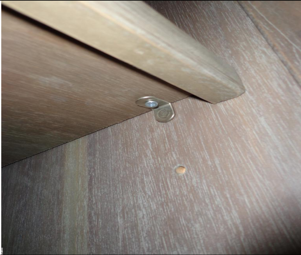
Adjustable shelf with metal shelf support.