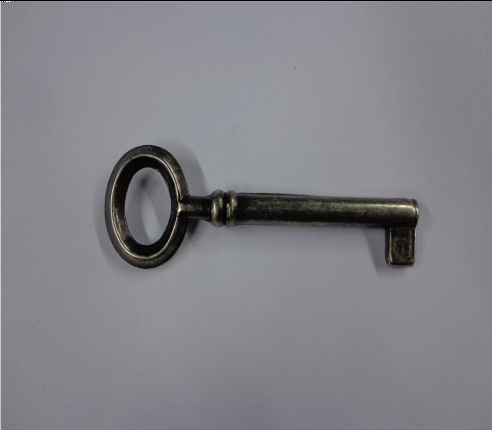
Tin colored key.