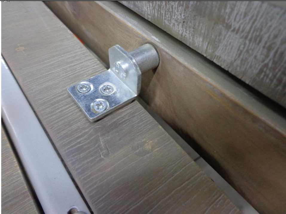
Tumble tube for folding mechanism of butterfly inlay.