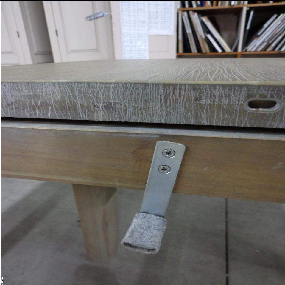
Support bar to support inlay when stored.