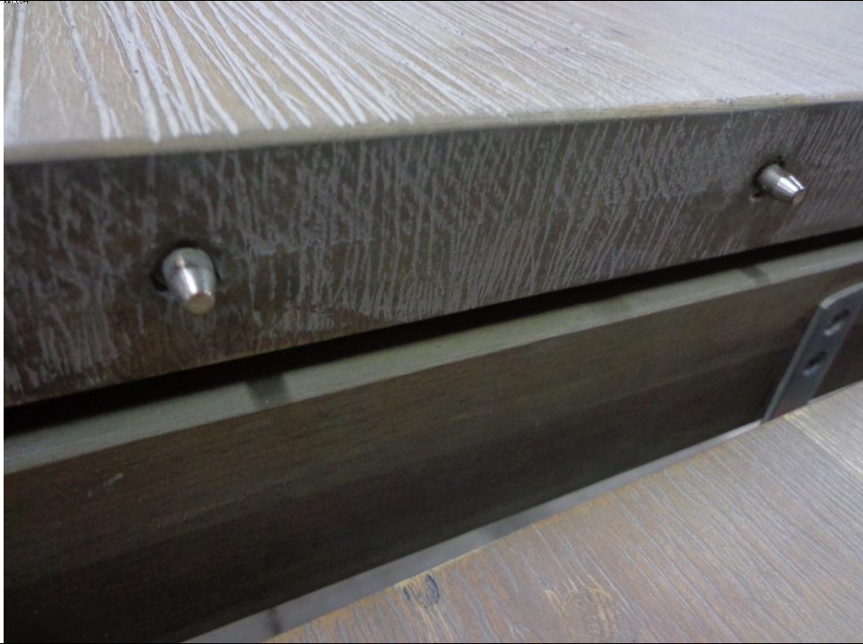
Positioning dowels to assure perfect fit for inlay.