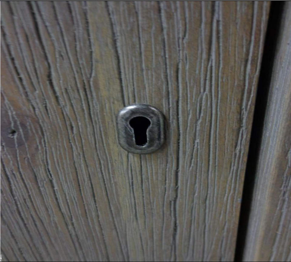
Tin colored key plate.