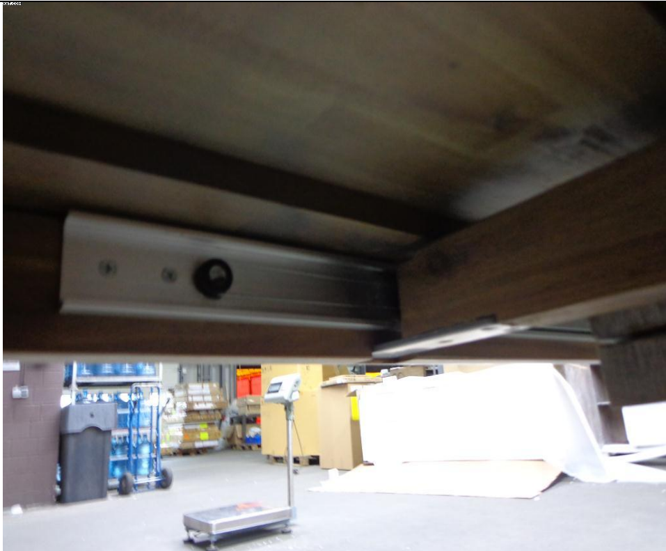
Sliding system for opening and closing of the table.