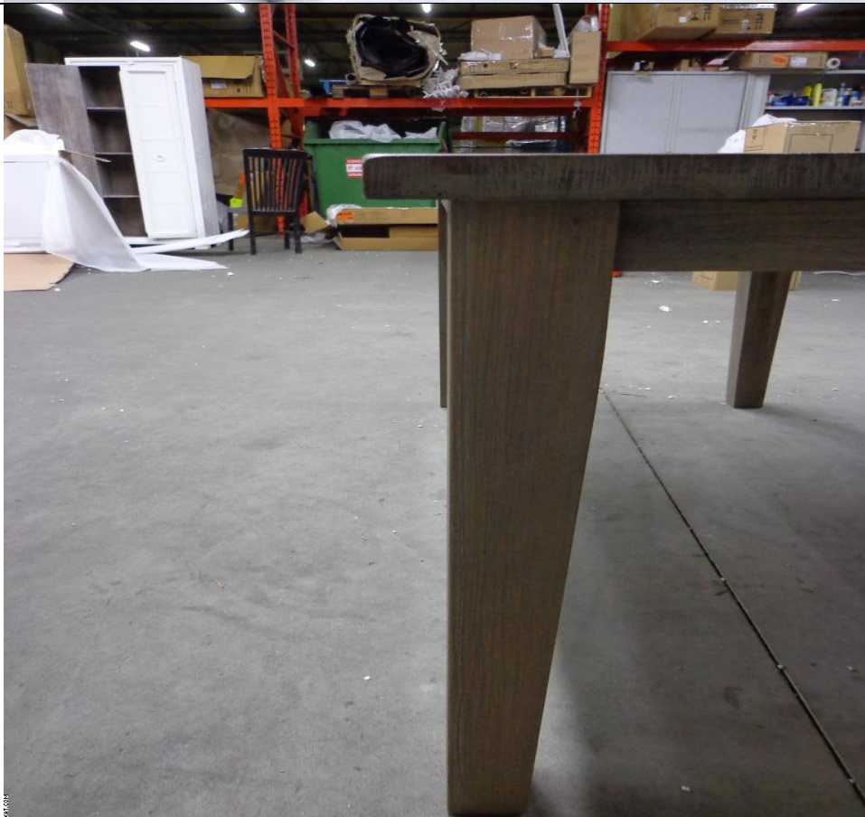
Tapered leg, top wide bottom small.