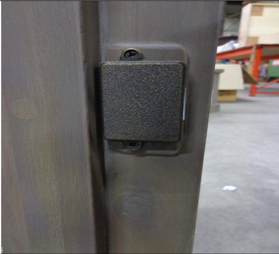
Lock for door.